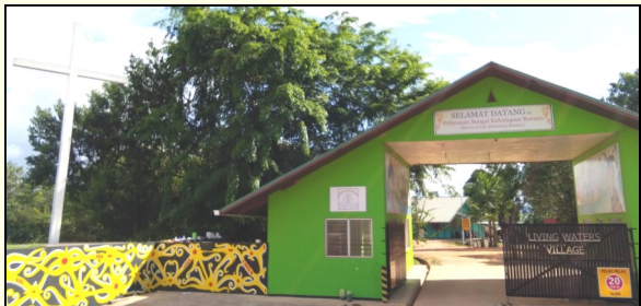
LWV Main Entrance

LWV current motorbike entrance and future vehicle entrance